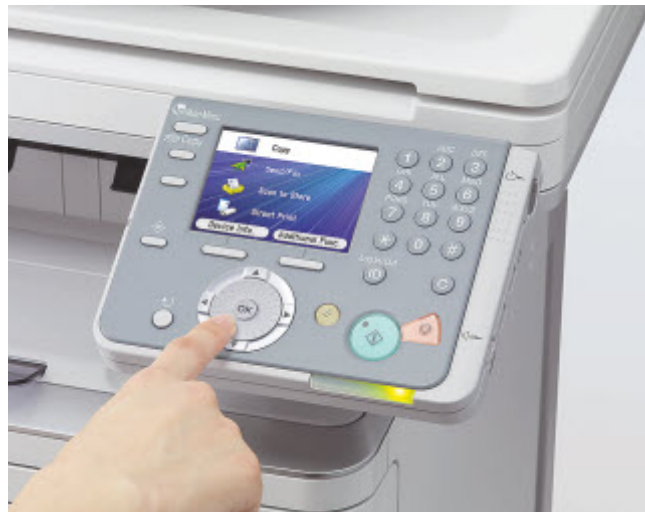
Easy-Scroll Wheel allows effortless access to all functions